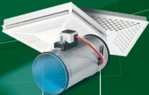
Air terminal device and control of airflow